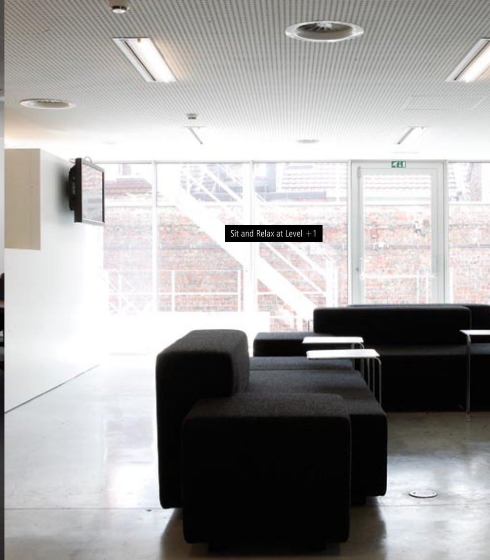
Sit and Relax at Level +1