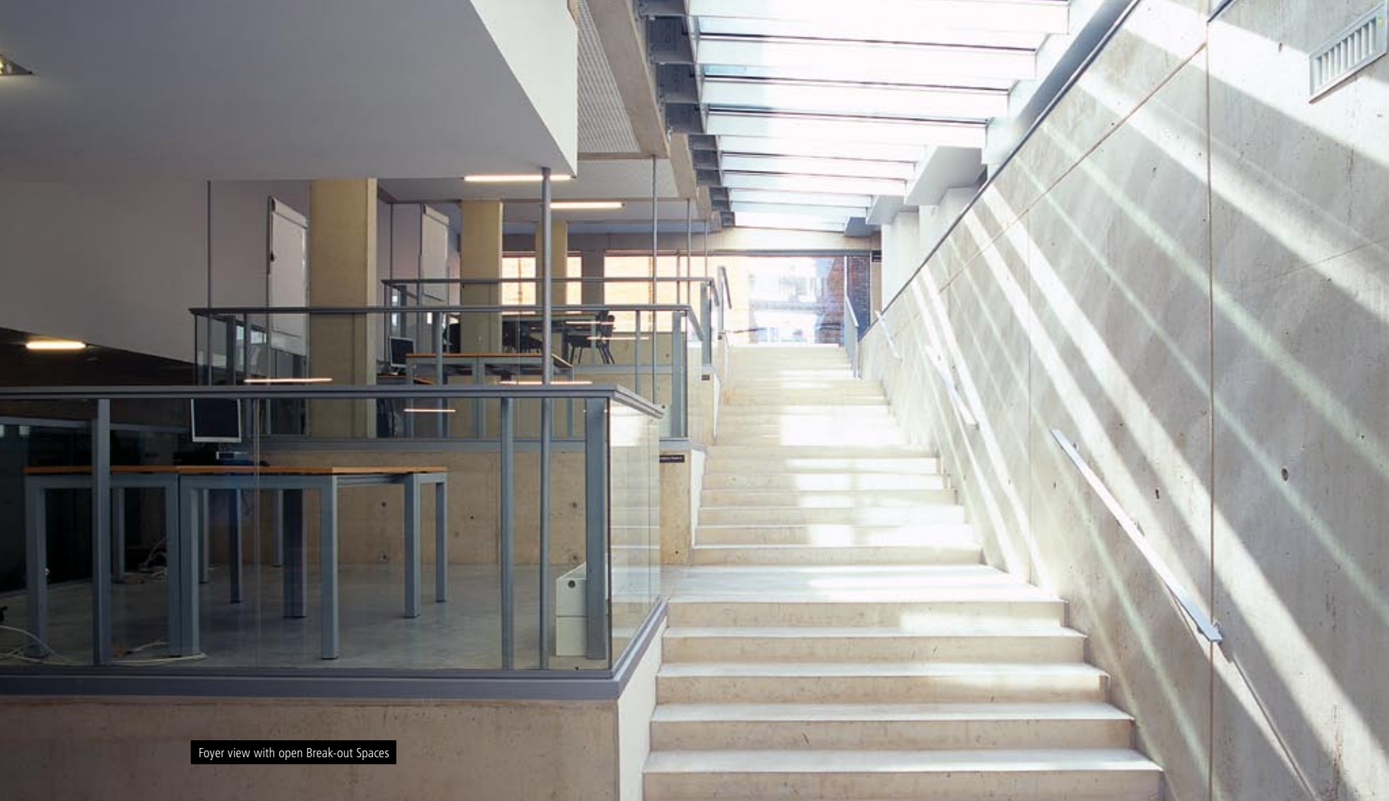
Foyer view with open Break-out Spaces