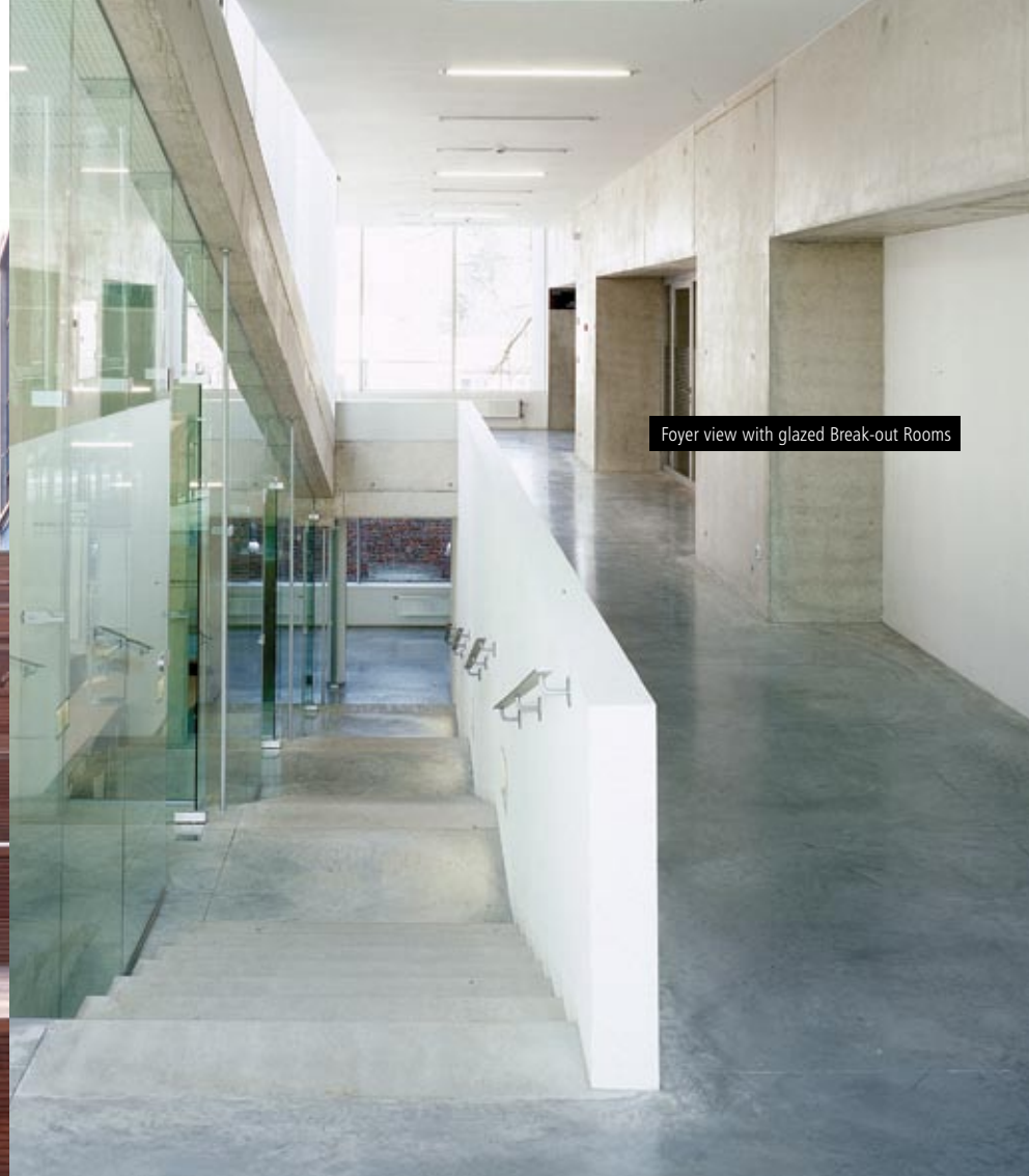
Foyer view with glazed Break-out Rooms