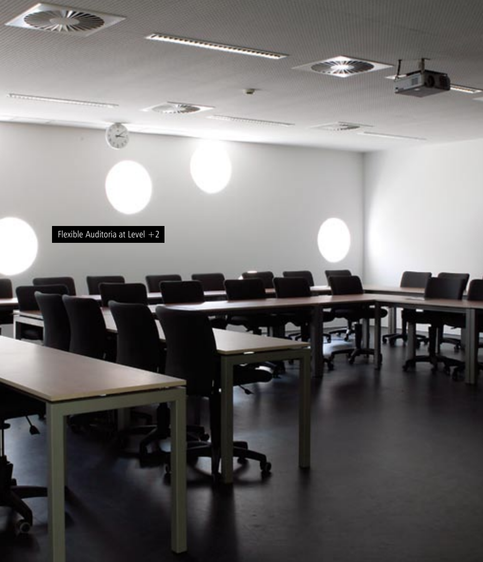
Flexible Auditoria at Level +2