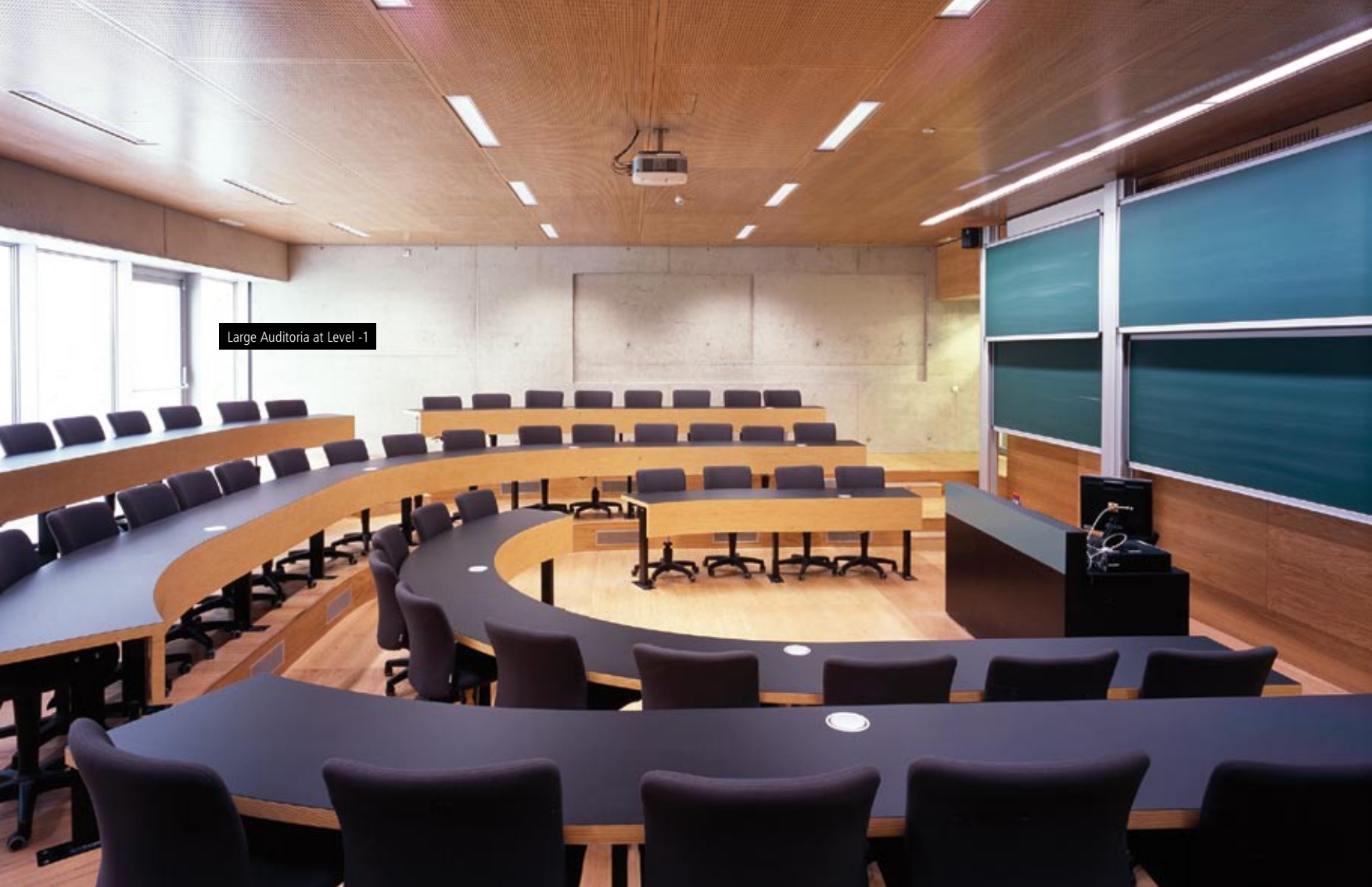
Large Auditoria at Level -1